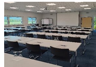
Seminar venue "Jura"

A meat-free alternative is available for vegetarian guests.