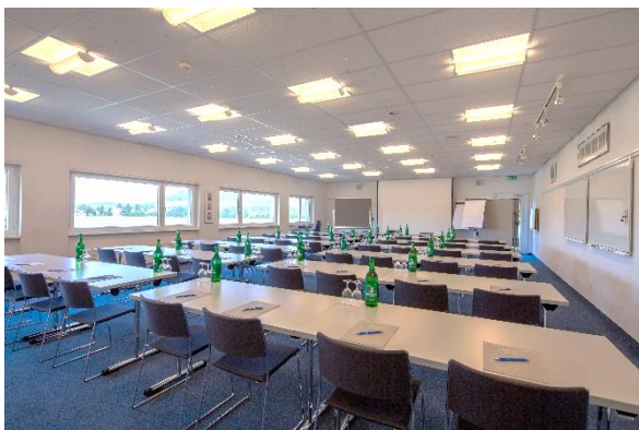
Seminar venue "Jura"

Our kitchen team will gladly cater for allergies, please let us know the number of vegetarians/vegans and any allergies on the day of arrival at the latest.