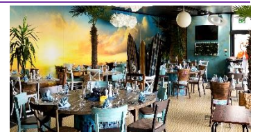
Pizzeria Pink Flamingo

For larger events, the unique event venue for up to 300 people is at your disposal.