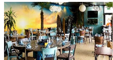
Pizzeria Pink Flamingo

For larger events, the unique event venue for up to 300 people is at your disposal.