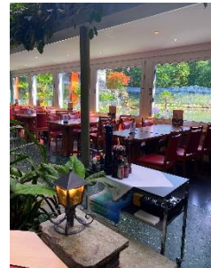
Tropical plants restaurant

The rooms offer 450 seats and impress with their diversity and originality. Whether in the oriental-inspired Maroc, the tropical restaurant or the sophisticated Seestube with a view over the forest lake. Each room radiates a special atmosphere through its own character. The glass-clad winter garden or the terrace offer the perfect ambience for sun lovers.