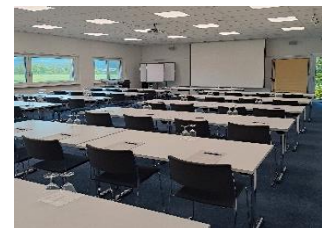
Seminar venue "Jura"

A meat-free alternative is available for vegetarian guests.