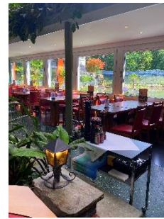
Tropical plants restaurant

The rooms offer 450 seats and impress with their diversity and originality. Whether in the oriental-inspired Maroc, the tropical restaurant or the sophisticated Seestube with a view over the forest lake. Each room radiates a special atmosphere through its own character. The glass-clad winter garden or the terrace offer the perfect ambience for sun lovers.